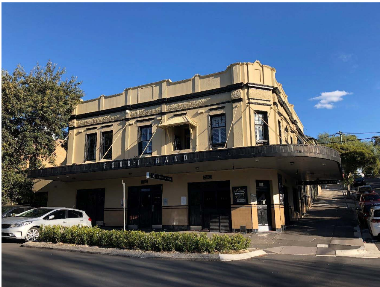
Figure 1: The Four In Hand Hotel viewed from Sutherland Street, looking towards the north eastern and north western elevations

The Four In Hand Hotel is a landmark corner commercial building constructed specifically for use as a hotel. Constructed in 1878, it has been in continuous operation since its construction. Refer to Figure 1 and 2 below.